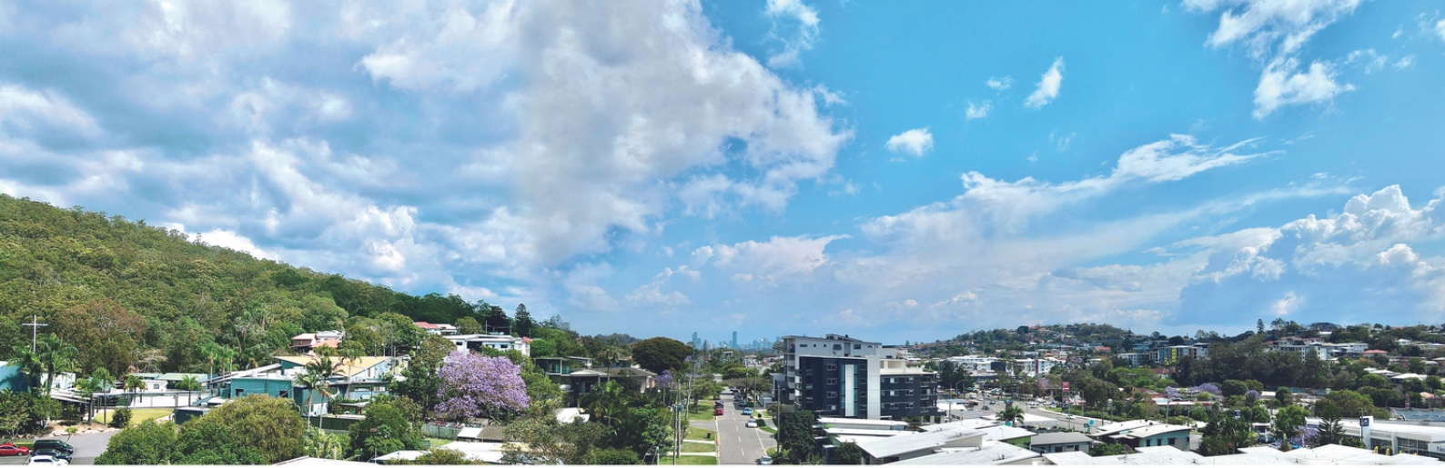
(view from apartment location)