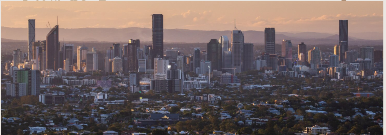
(view from Mt Gravatt Lookout)

The Eastside apartments with unblocked mountain views.